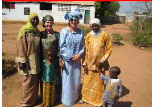
Our teachers in Gam-

Next week we would like to do some fundraising to support our federation partner school in Gambia.