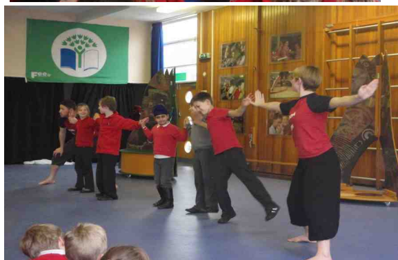
Demonstrating Sound travelling through air