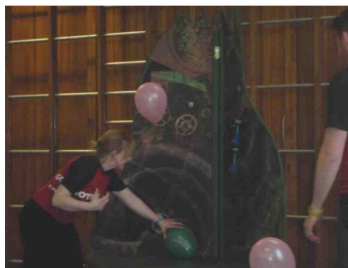
Look, it works! The balloon is attached to the board

In class 2 children carried out an investigation into whether you could change the shape of play dough, a stone and some paper by rolling, squeezing, stretching or pushing it.