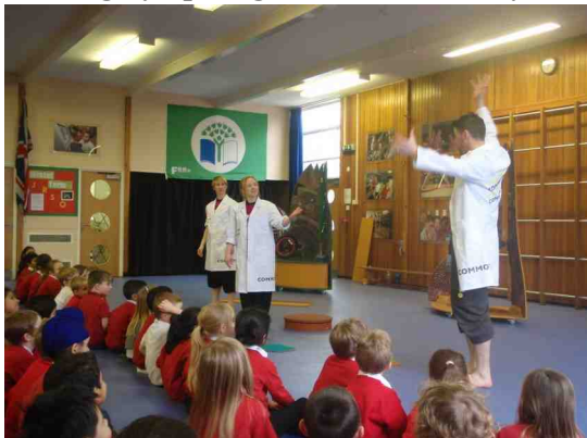
The Highly Sprung Team in Assembly