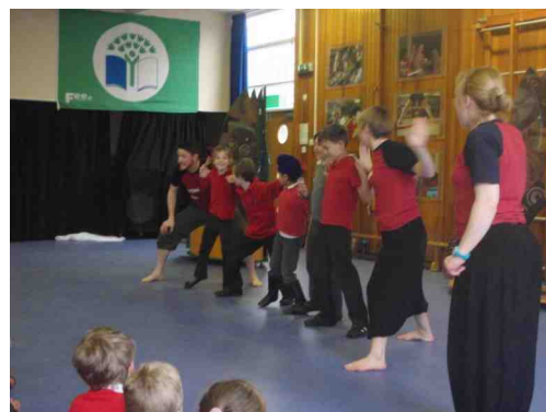
Demonstrating Sound travelling through water