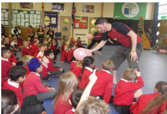
Whose hair shall we use to demonstrate Static Electricity by rubbing it with a balloon?