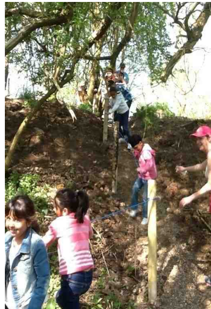
Braving the rope walk!

We had to build a dam across the river – it was a tricky task but we tried really hard!