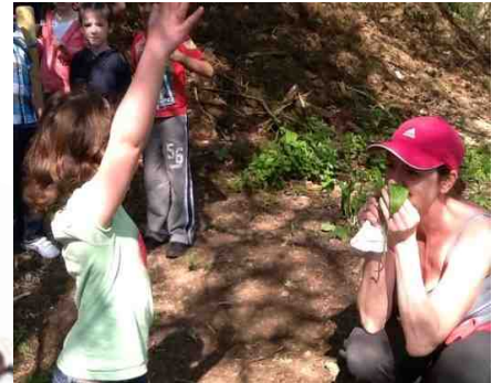
Finding wild garlic.

We learned about bats and touched a live Pipistrelle bat that had been rescued!