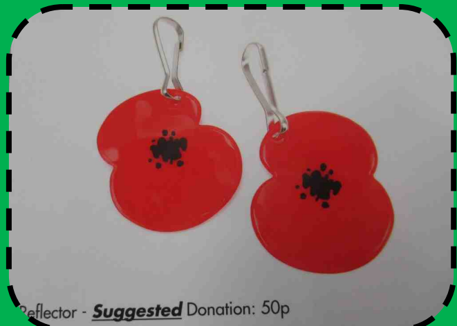
Reflector - Suggested Donation: 50p