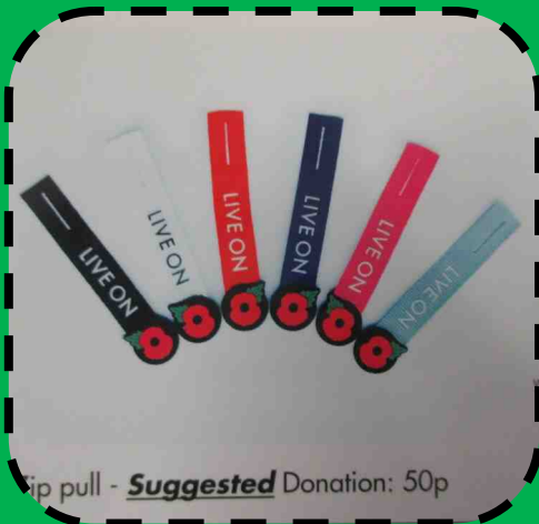
Zip pull - Suggested Donation: 50p

The Royal British Legion looks after serving and ex-servicemen, women and their dependants who are in need, financially or otherwise. Last year, fifty one million pounds was raised to help those in need.