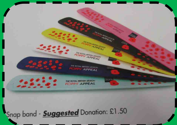
Snap band - Suggested Donation: £1.50