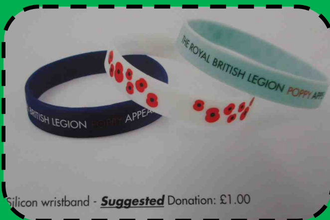
Silicon wristband - Suggested Donation: £1.00