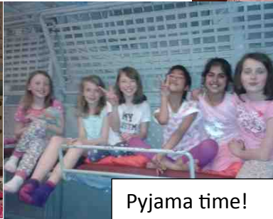
Pyjama time! The Pink Ladies!