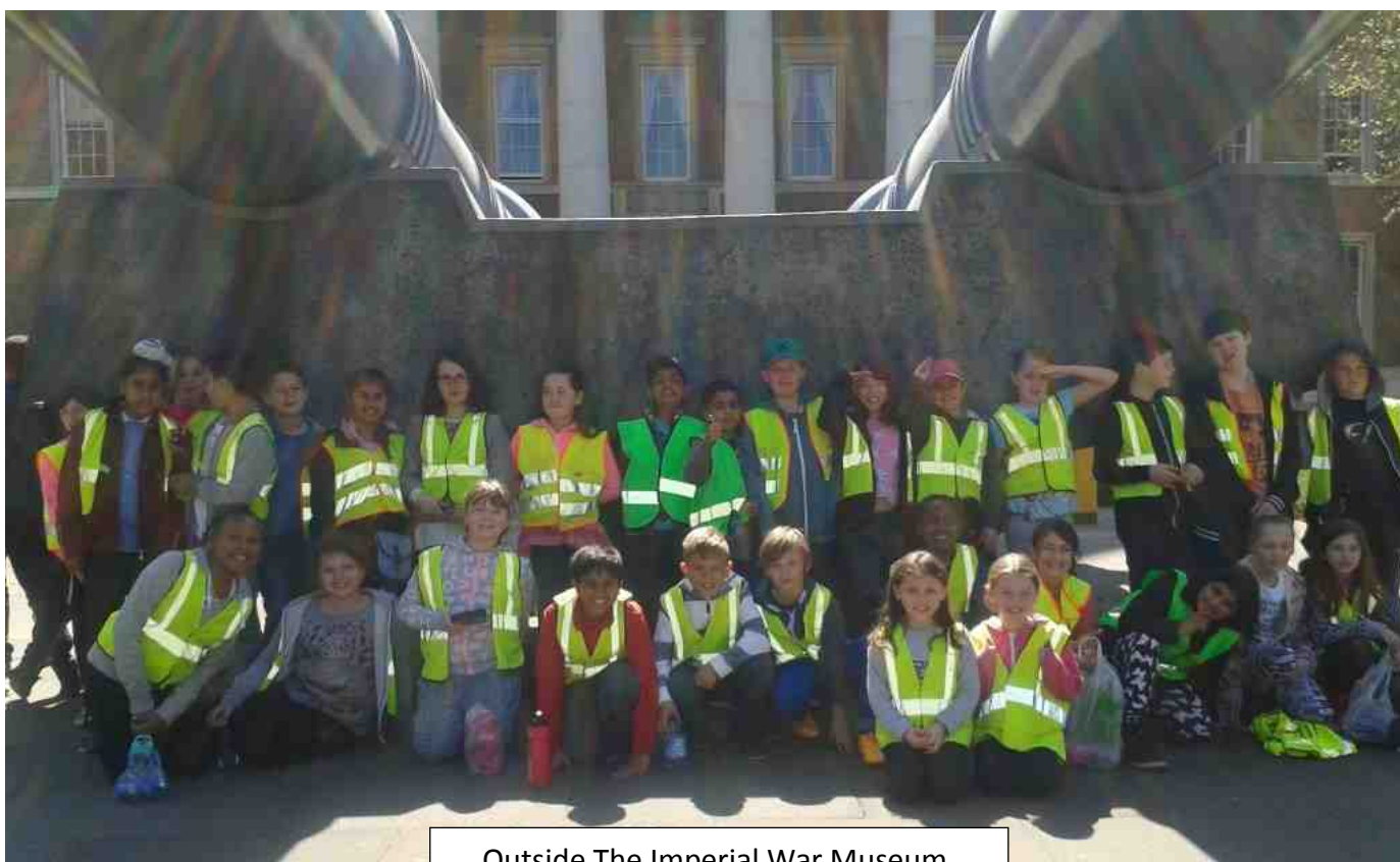
Outside The Imperial War Museum.

We were delighted that they have finished refurbishing the Imperial War Museum as this is the first year that we have been able to include it in our trip.