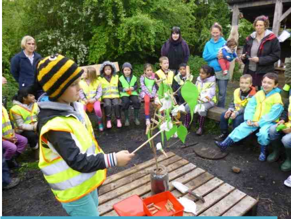
Calum-bee collecting pollen from the blossom.