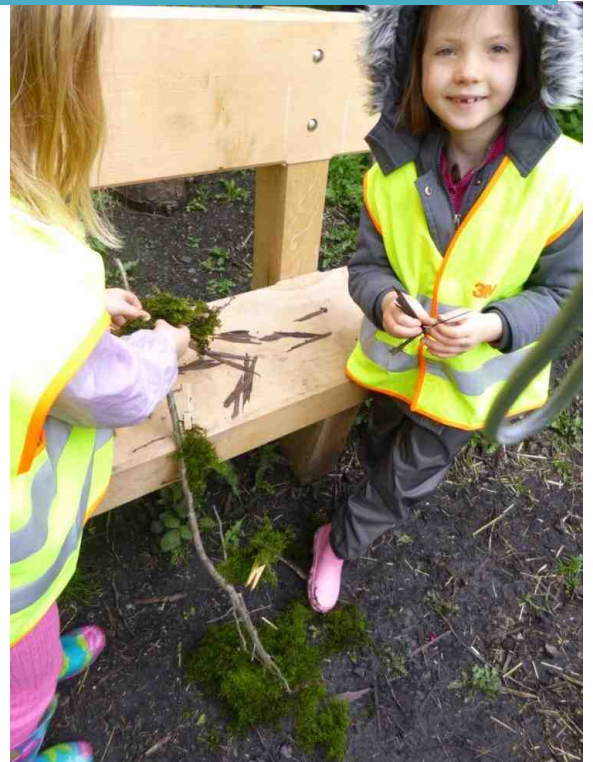
Creating tree sculptures using natural materials.