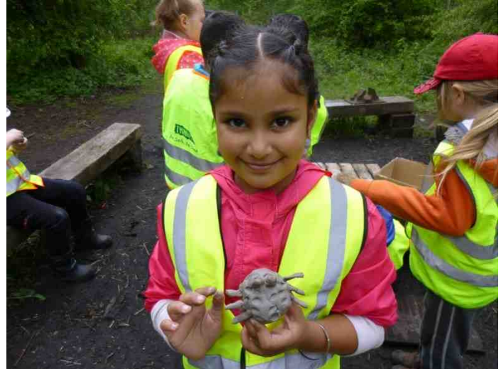
Making clay mini-beasts.