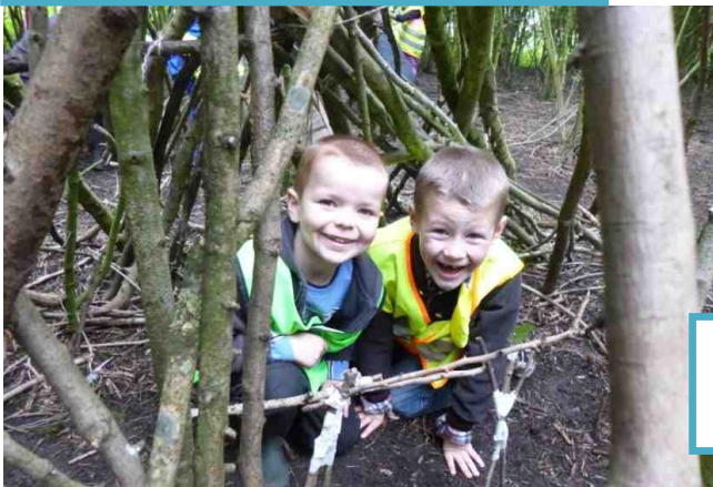
Building a home for our stick people.