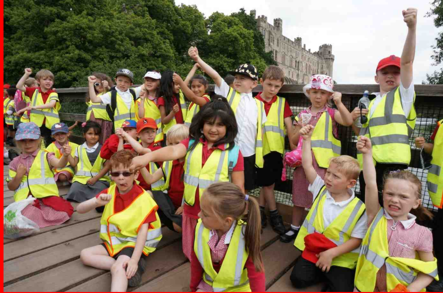
Year 1 CG class at Warwick Castle.