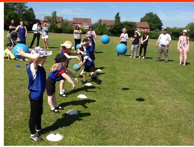
Miss Bond's class really enjoyed their first ever Sports' day. They were very good at taking turns and encouraging each other.