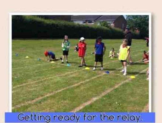
A close race.