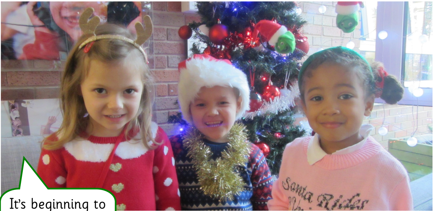
It's beginning to look a lot like Christmas!