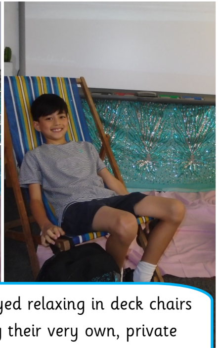
The children enjoyed relaxing in deck chairs before watching their very own, private Punch and Judy show.