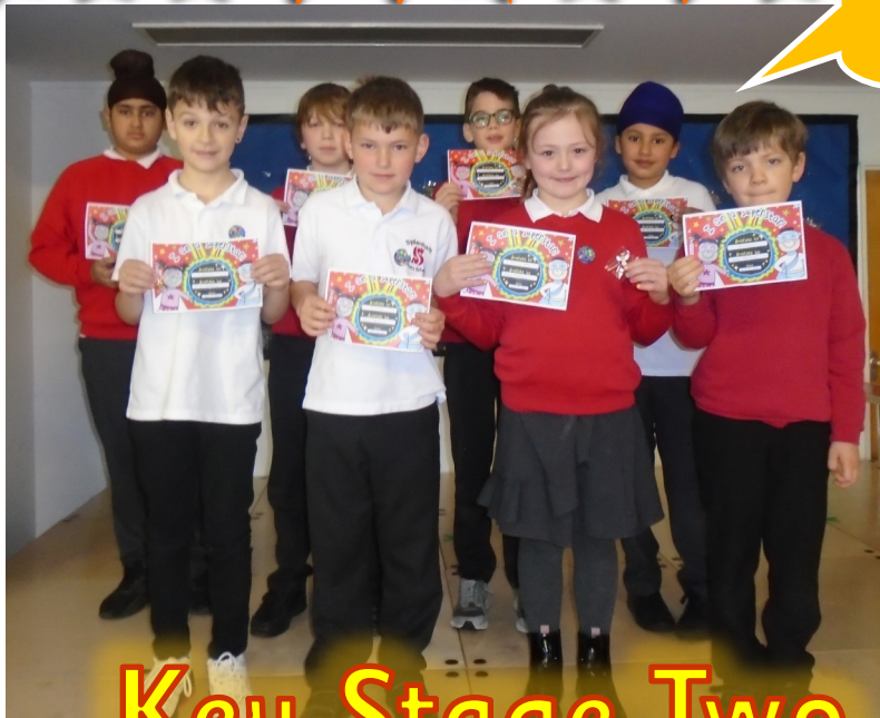
Key Stage Two