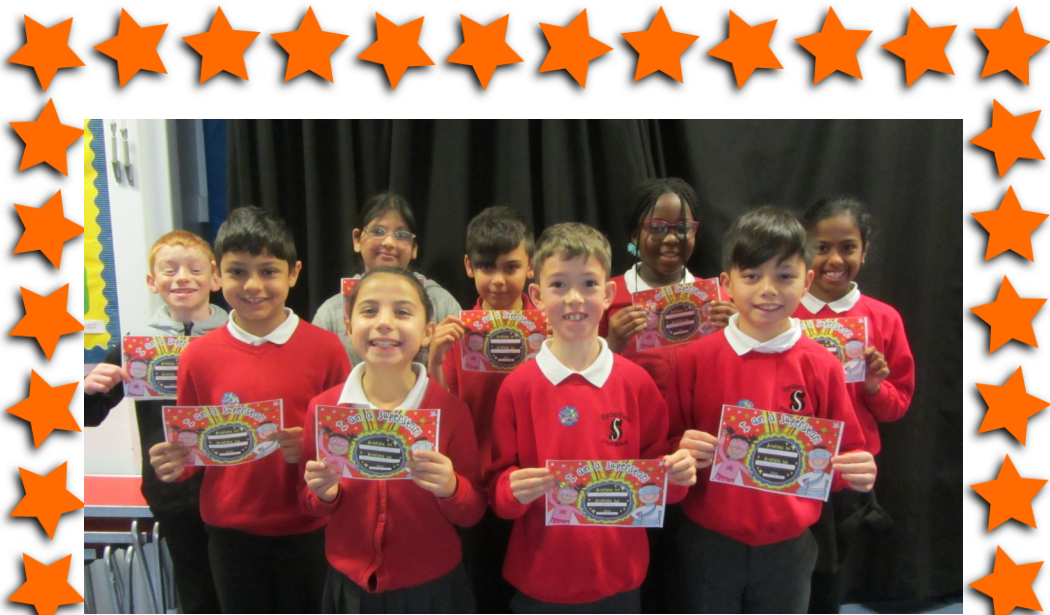
EYFS & Key Stage One