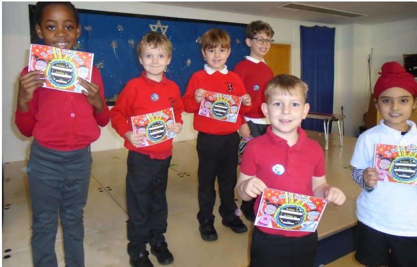
EYFS & Key Stage One